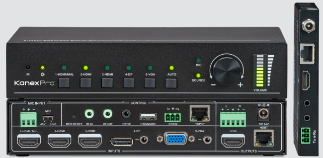
SW-HDSC51HDBT 5 Input Seamless Presentation Switcher over HDBaseT up to 230ft.

The KanexPro Seamless Presentation Switcher and Scaler features five inputs, including HDMI, DP and VGA, with one local HDMI output and one HDBaseT output. Supporting instant switching with zero latency, the Seamless Presentation Switcher and Scaler is compliant with the latest HDCP 2.2 specs, supports CEC commands and EDID management, and the output can be extended with Power over HDBaseT (PoH) up to 230 feet. With a built-in audio de-embedder for HDMI and VGA inputs, the Seamless Presentation Switcher and Scaler includes an IR remote, as well as control via buttons, RS232 and web-based GUI. For more product information please click here .